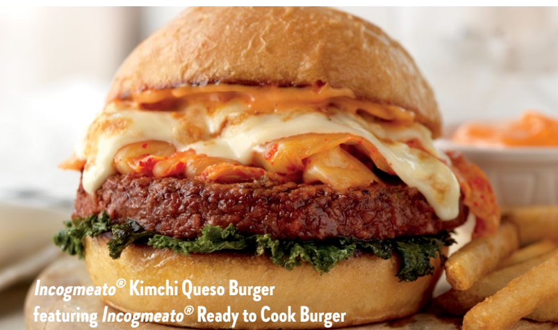
Incogmeato ® Kimchi Queso Burger featuring Incogmeato ® Ready to Cook Burger

Both on and off-premise with consumer-desired PLANT-BASED BURGER options!