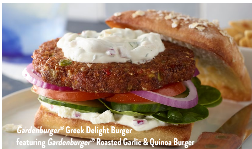
Gardenburger ® Greek Delight Burger featuring Gardenburger ® Roasted Garlic & Quinoa Burger